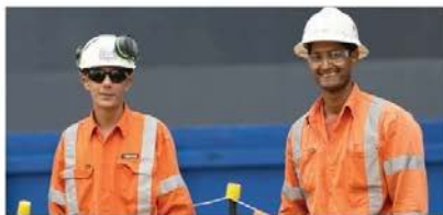
Workers on the Sydney Metro West project

The first step is to complete Sydney Metro's pre-employment program. This program has been developed to give you the skills and hands-on training to kick start your career in the construction industry.