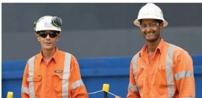
Workers on the Sydney Metro West project

GLC's subcontracting workforce are looking for 15 Aboriginal and Torres Strait Islander people who are interested in starting a career in construction. You will work on Australia's biggest public transport project while completing a Civil Construction apprenticeship or traineeship. The first step is to complete Sydney Metro's pre-employment program. This program has been developed to give you the skills and hands-on training to kick start your career in the construction industry.